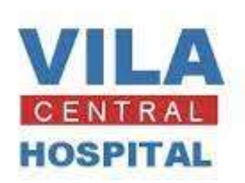
Photo: Sodacan (Modified) Creative Commons Attribution-Share Alike 3.0 Unported license